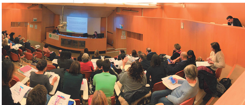
Participants of the 5th regional conference of the HPH Network of Friuli Venezia Giulia Region.