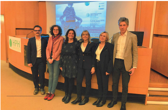
The hosts of the 5th regional conference of the HPH Network of Friuli Venezia Giulia Region.